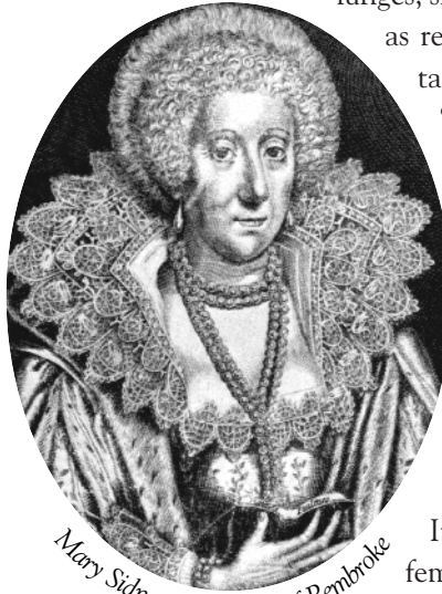
Mary Sidney, Countess of Pembroke

The significant term here is “concrete.” Webster compacts, sometimes to the point where the meaning is endangered, because in an effort to scan while keeping the word count as low as possible he will leave out articles, prepositions, even verbs. His speeches are like a series of jabs and lunges, short, sharp and deadly, a style that closely resembles that of Mary Sidney