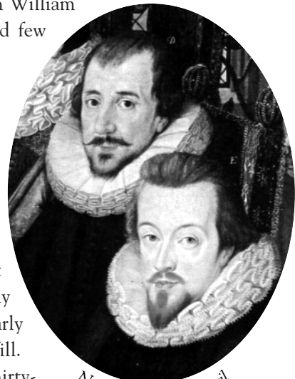
Northampton and Cecil

The disgust this caused was overwhelmed by grief when that November the oldest son of the King and Queen, the nineteen-year-old Prince of Wales, died suddenly (some say of typhoid fever, some say smallpox). Prince Henry had begun to display the moral sense and statesmanship so lacking in his father. The thought that whatever foolishness the King might promote at a given moment could conceivably be mended once the Prince succeeded him had given the