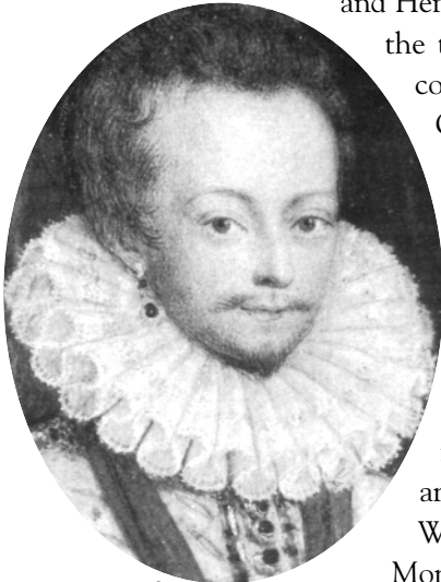
Sir Robert Carr

Although James made peace as best he could among the various Court factions when he took the throne in 1603, his poor management tactics caused endless problems for the functionaries that ran the government. Early on he had allowed Robert Cecil (now Earl of Salisbury) and Henry Howard, (now Earl of Northampton) to maneuver their way into the top offices. Northampton’s nephew Thomas (now Earl of Suffolk) completed the faction that surrounded the King. A third Howard, Charles (Earl of Nottingham), still held the seat on the Privy Council he had been given years earlier by Queen Elizabeth.